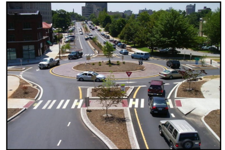
College Street now