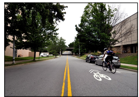
Central Avenue - proposed