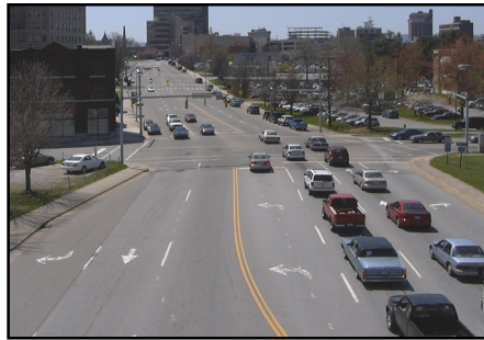
College Street before

For more information email www.iwalk@ashevillenc.gov or call (828) 232-4540